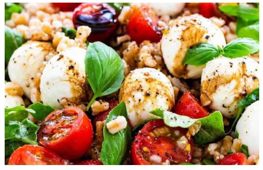
CAPRESE STYLE SALAD RECIPE

This simple light Italian salad, which is a favourite with our family, is perfect for a lunch on a hot Summer's day. Sit out on the patio and enjoy this tasty salad with a fresh piece of Italian bread. We like ciabatta or pannini. Do not forget to dip the bread into the dressing, to soak up the delicious flavours. Serving for four.